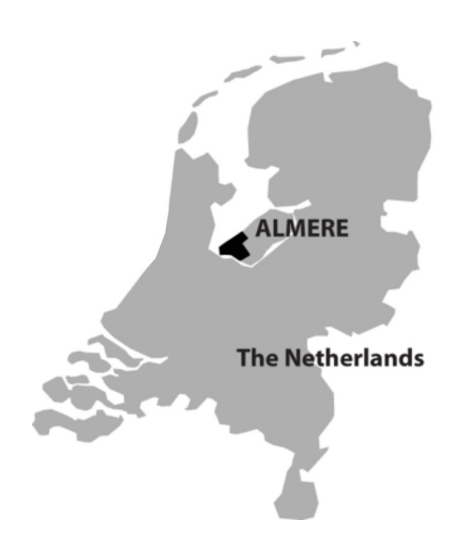
Figure 2: The location of Almere in The Netherlands

One of the Dutch municipalities trying to organize for "organic development" is Almere. Almere can be seen as an interesting example of moving from one side of the spectrum to the other: from the blue-print approach to more spontaneous development (Cozzolino 2015a). The city is an "extreme case" (Flyvbjerg 2006) of the change in Dutch planning and development. Almere is situated approximately 30 kilometers northeast of Amsterdam. The city was