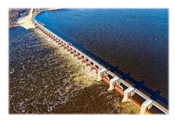
Figure 7 Hydropower production

on soil and water quality through the run-off of nutrients, pesticides and herbicides. It also reduces the amount of land available for other agricultural production, causes fragmentation and degradation of land and deteriorates ecosystems and biodiversity—thus, reducing the ability for adaptation to climate change. In addition, energy generated through hydropower helps to achieve targets for the use of renewable energy but has a negative impact on water quality and ecosystems and lays spatial claims on land. Implementation of the River Basin Management Plans is hampered by a lack of manpower, funding, and fragmented background data . In addition, substandard monitoring and evaluation lead to insufficient knowledge of the impacts of measures already implemented. Among the parties that need to act, this creates resistance towards new measures.