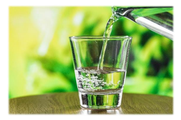
Figure 9 Provision of drinking water

with the aim of improving raw water quality and water storage in the natural landscape to make the provision of drinking water more sustainable. Objectives concerning the sustainable delivery of water are positively linked to objectives for land use, climate change mitigation and adaptation. Stakeholders noted that regulation to improve water quality in catchments, enforced by the National Environment Agency, can be at odds with local cost efficiencies. This may lead to a downward spiral in policy implementation in cases of limited dialogue . Also, the agrienvironment schemes of the CAP decrease in popularity among farmers and landowners, because of detailed regulations, variability of payments, lack of coordination and cooperation between authorities, and uncertainty about the future after a Brexit.