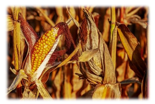
Figure 5 Negative interactions in the Nexus are due to producing 1st generation biofuel crops

Some policies in the nexus may negatively affect water objectives. For example, the production of biofuel crops may cause water pollution and scarcity, and hydropower may impede a good ecological status of rivers. Also, economic policy for the agricultural sector may negatively affect water objectives if environmental standards are not met. In these cases, progress