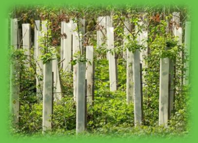
Figure 1 Reforestation

1. <u>Synergy:</u> Good practices in water and land management generate positive effects in catchment areas: restoration of natural courses of rivers, soils and infiltration capacity, prevention of soil erosion and reforestation are nature-based solutions to combat flooding and drought and are synergistic with climate change mitigation and adaptation. These synergies were confirmed by cases in the Czech Republic, Slovakia, Germany, Andalusia, and South West England.